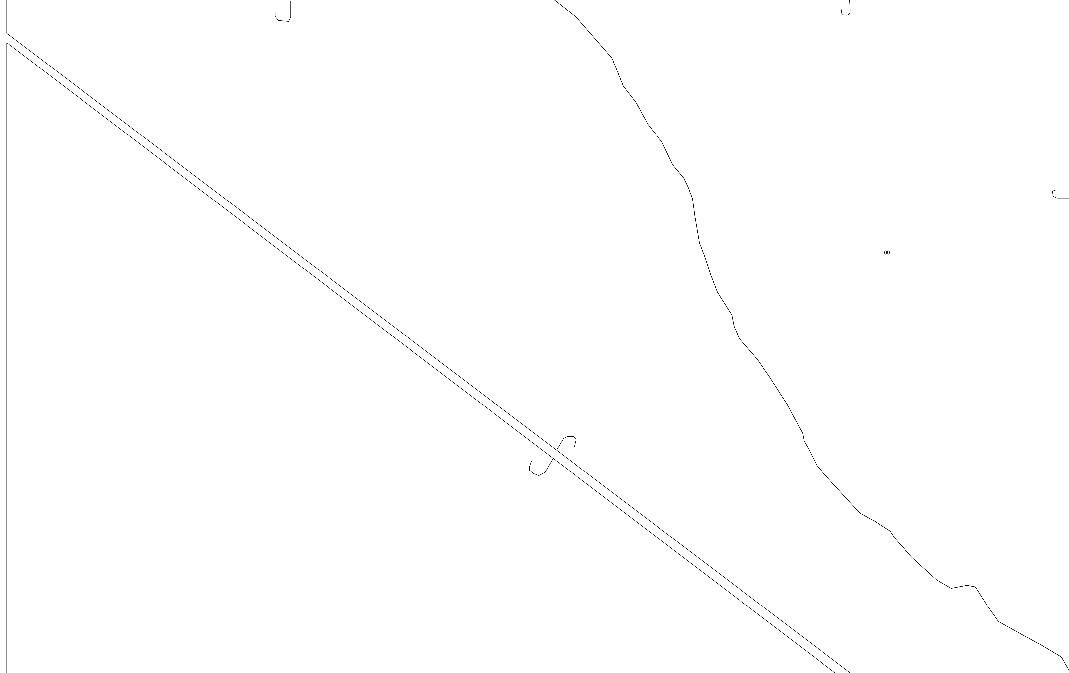
INDEX TO ADJOINING SHEETS